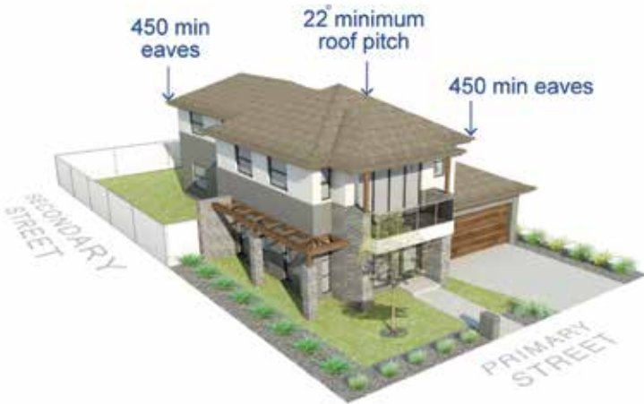
Diagram 02: Roof Design

Dwellings located on corner lots are in a prominent position within the estate, as such they are required to provide façade articulation to both the primary and secondary street frontages, so that the façade 'wraps' around the corner and becomes a feature in the streetscape.