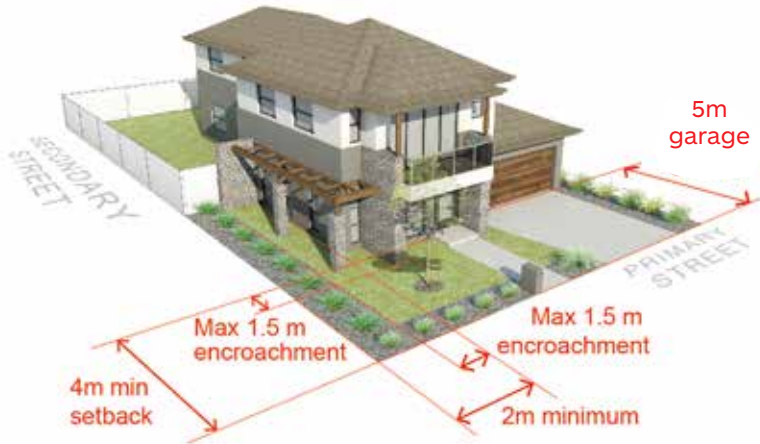
Diagram 03: Corner Lots

Appropriate corner lot façade features will be assessed on a case-by-case basis by the DAP.