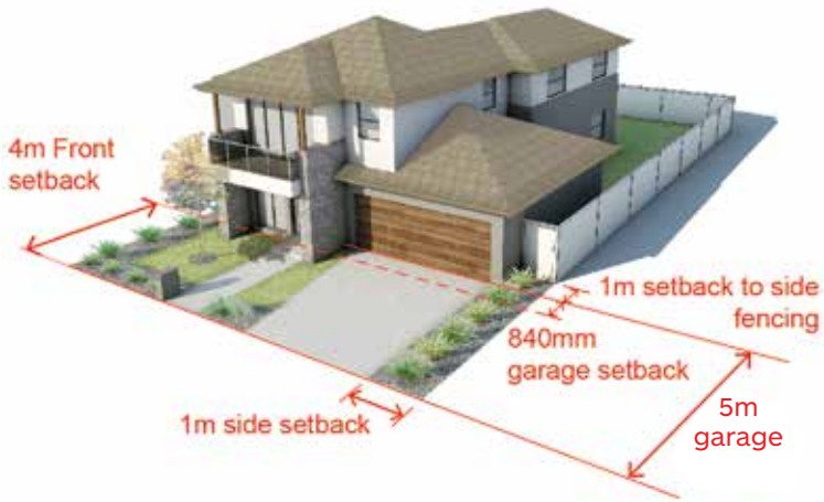
Diagram 01: Setbacks

All dwelling designs within Kingsfield are required to ensure all ceiling and building heights comply with Clause 54 or 55 of the Hume Planning Scheme. These clauses are also known as 'ResCode'.