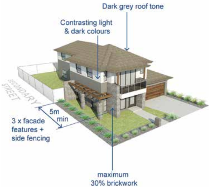
Diagram 04: Building Materials