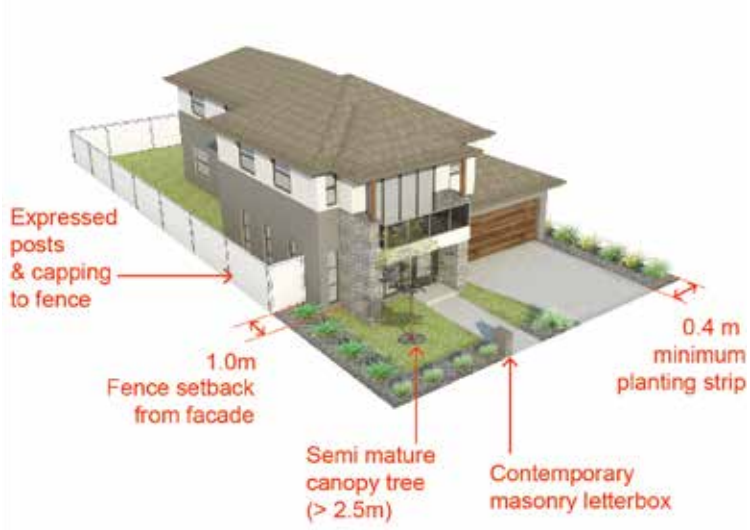
Diagram 05: Landscaping and Fencing

On all lots over 300m², a rainwater tank with a capacity of not less than 2000 litres must be provided. The water is to be used for toilet flushing and other suitable internal and external uses. The colour of the rainwater tank must complement that of your house and be located so that it is not readily visible from the street or neighbouring properties.