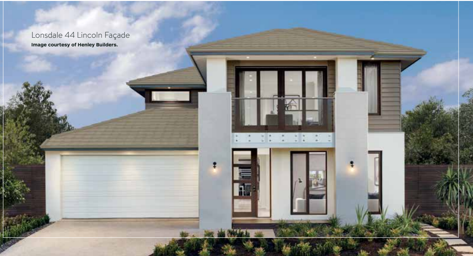
Lonsdale 44 Lincoln Façade Image courtesy of Henley Builders.