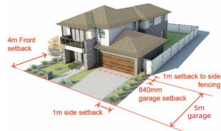
Diagram 01: Setbacks

All dwelling designs within Kingsfield are required to ensure all ceiling and building heights comply with Clause 54 or 55 of the Hume Planning Scheme. These clauses are also known as 'ResCode'.