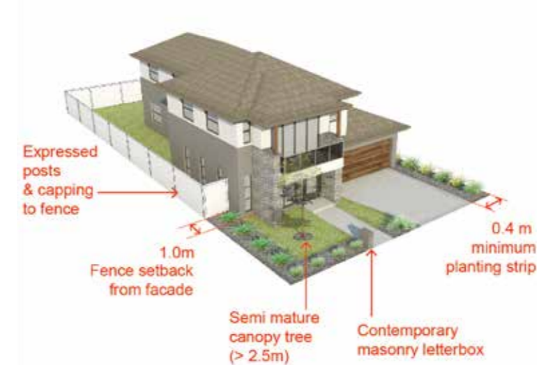
Diagram 05: Landscaping and Fencing

On all lots over 300m 2 , a rainwater tank with a capacity of not less than 2000 litres must be provided. The water is to be used for toilet flushing and other suitable internal and external uses. The colour of the rainwater tank must complement that of your house and be located so that it is not readily visible from the street or neighbouring properties.