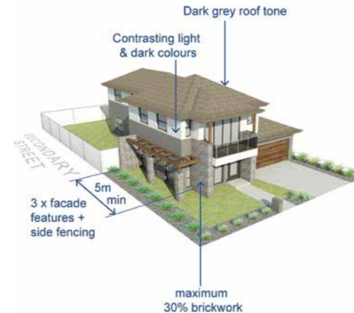
Diagram 04: Building Materials