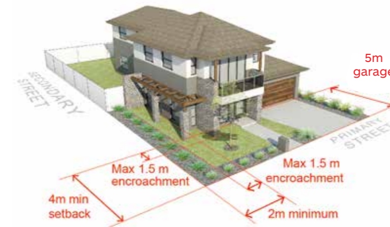
Diagram 03: Corner Lots

Appropriate corner lot façade features will be assessed on a case-by-case basis by the DAP.