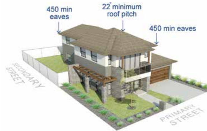
Diagram 02: Roof Design